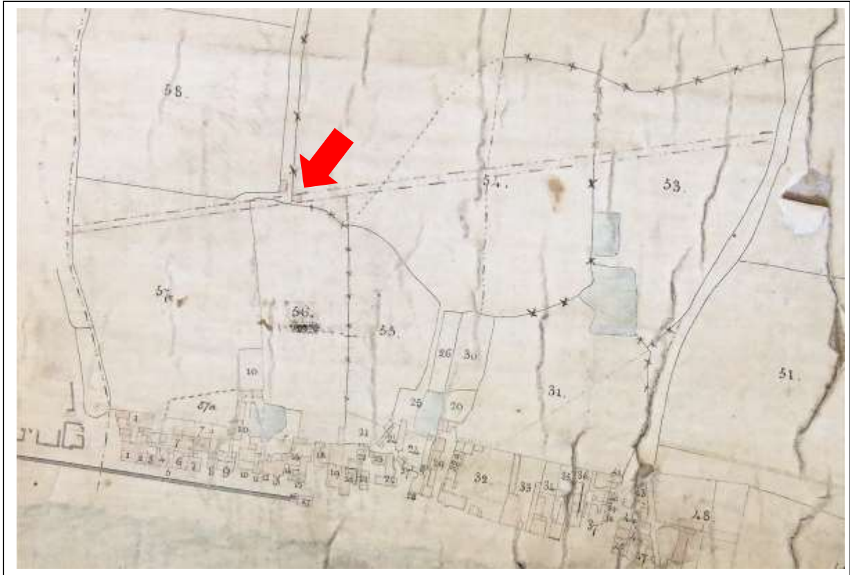
Figure 2: The ropewalk in 1814. It is marked by parallel dotted lines towards the top of the map. The building on the ropewalk is arrowed. Parkgate front is at the bottom of the map, with the sea-wall partly built. Source: Bangor Archives, Mostyn MSS S 8702 (detail). With thanks to Susan Chambers.

seems likely that this building would have housed one or more 'jacks'. 22 The jack was a frame on a spindle fitted with three or more hooks and pointed along the walk ( Figure 3 ). The jack was used to make both yarn – a continuous series of overlapping hemp fibres – and rope, made up of long strands of yarn. In order to make rope, a movable hook was placed at a distance from the jack commensurate with the length of rope being made. Strands of yarn were strung between the jack and hook. As one man rotated the jack using a crank handle, another man walked slowly from the hook, controlling the rate of twisting of the rope forming behind him. The hook would slowly be moved closer to the jack as the length of the developing rope contracted as the yarn was twisted.