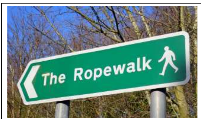
Figure 4: One of several signs for The Ropewalk in Parkgate today.

The use of the name Ropewalk, or a variant, first appears in the apportionment to the 1847 Great Neston tithe award. 27 It was applied to a field adjacent to the walk - Rope Walk Field; two nearby fields had related names. The walk itself was named Cheltenham Walk in 1849 when Edward Mostyn Lloyd Mostyn sought to give a more salubrious feel to the area as he sold it off in an auction (the nearby row of black and white houses on Station Road, built in 1900, was to be called Cheltenham Place). 28 References to both Cheltenham Walk and Rope Walk can be found for decades after Mostyn's sale – sometimes both names can be found in reports of a single local council meeting. 29 However, Cheltenham Walk appears to have been the officially recognised name and it was not until 2 May 1955, after some argument, that Neston Urban District Council issued an order permanently altering the name to 'Rope Walk' – which soon mutated to 'The Ropewalk' (Figure 4). 30